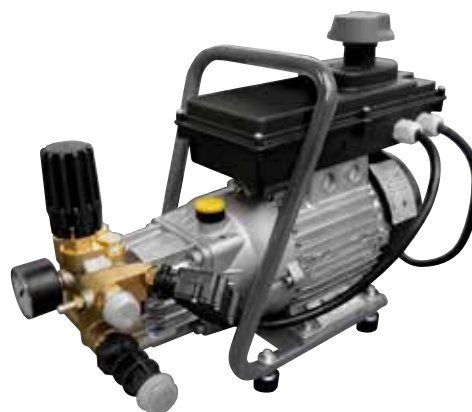
LITE 1510 XP model