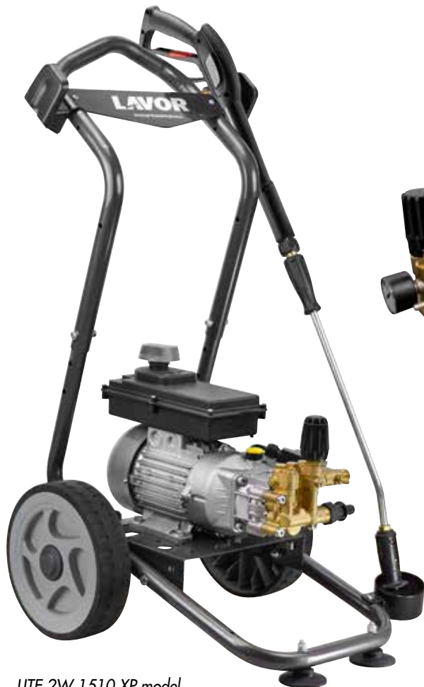
LITE 2W 1510 XP model